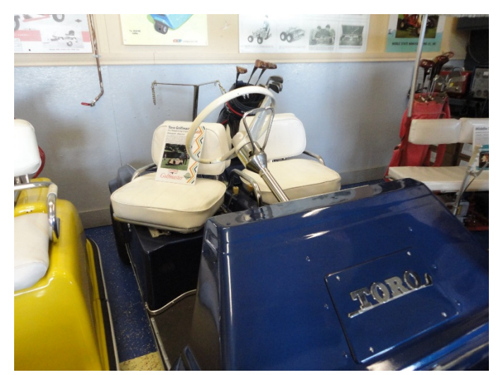
TORO GOLFMASTER. Toro Manufacturing Corporation – Minneapolis, Minnesota. Toro is a huge player in the turf equipment business but only jumped into the golf

The golf car with the fringe on top is a folding, two passenger Mini Golf Cart by Middle State MFG. Co. Inc., Columbus, Nebraska, 1965. Middle State MFG produced a two-person gas motor golf car that was guaranteed to fold up and fit into the trunk of a 1965 Mustang. The steering mechanism was not very intuitive – to turn left you pushed the tiller stick forward and to turn right you pulled back on the tiller stick – to go forward the driver would depress the small gas pedal and to stop, the brake would be automatically applied if you took your foot off the gas pedal.