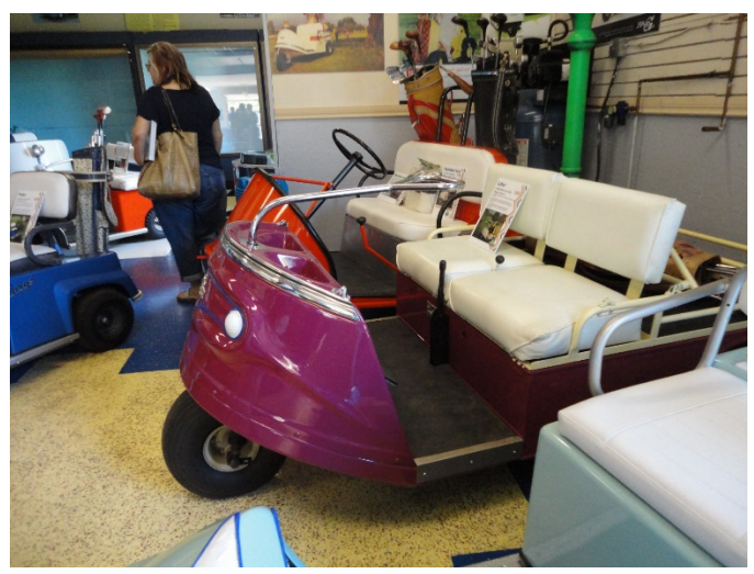
Laher Springs and Tire Corp. - Memphis, Tennessee.