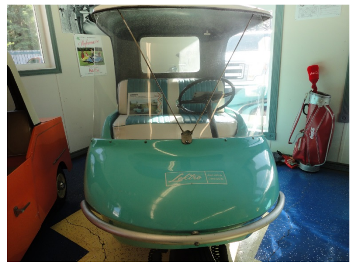
Lektro Golf Car, Lektro Inc., Astoria Oregon.

dealer would order the front tandem seating component directly from Watson Distributing in Houston. The concept of having the entire foursome and the caddy riding the same golf car did not last long. Cushman Motors did however become one of the most prolific makers of vintage golf cars. Golf car production ceased in 1975 when the last of the Cushman golf cars rolled off the assembly line.