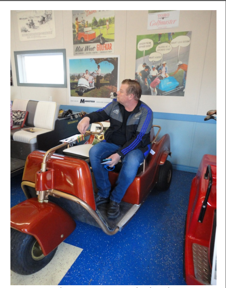
DIPLOMAT II by Sears – Sears Roebuck and Co., Chicago, Illinois.

Sears was best known for marketing golf cars made by other manufacturers under the Sears name: most notably the T-Mate, the Diplomat, the Tuffy and Lectracar Duo. The Sears cars were known to be of good quality at a good price. The earliest ad is from 1955 with the Lectracar Duo, followed by the Diplomat/Tuffy 1956, Diplomat II 1959, Sears T-Mate 1961, and the Diplomat III in 1963.