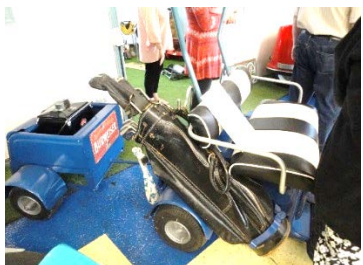
🛱 Par-Pony, the Western

The bright orange car in the right of the photo is The Sports Rider by the Electric Car Company of California – Long Beach. The Sports Rider is another prime example of an electric micro-car which had an optional golf bag attachment. This is an example of a little car that had a dual purpose. It was designed both to quietly travel around small towns and also make its way onto the golf course. Many of these cars could be spotted on both Catalina and Annabelle Islands off the coast of California.