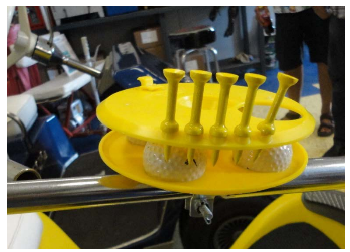
Golf ball and tee holder on the BADGER CANADIAN