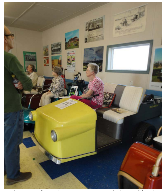
Taylor Manufacturing Company – Anaheim, California 1956. This is an example of an early golf car that was built like an automobile. It's big, it's long and it's heavy. It has headlights and a full-size rear end on it. It came out for one year in 1956 and it's suspected of being the Taylor in the Taylor-Dunn Company that began operating in 1957.

This story is much like many others of hard-working families and small-town businesses who built golf cars in the early days to satisfy the needs of their communities.