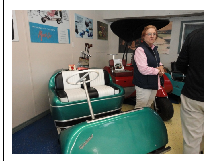
ENVOY by Electricar of Canada Ltd.

Lektro first started making golf cars in 1954 and were best known for their light-weight aluminum frames. The addition of the optional canopy adds a striking feature to the golf car. The company is still in business today and specializes in making small tugs for the aircraft industry.