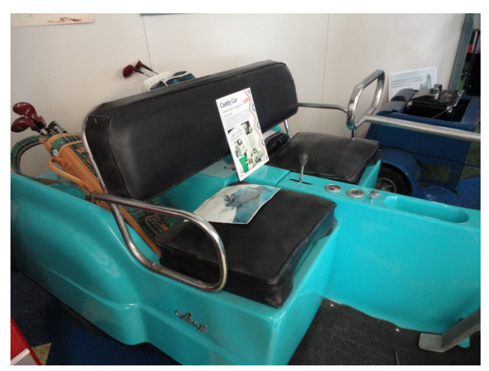
Caddy Car, Powered Products Company Inc., Austin Texas 1960.

The Terra Car came on the market in 1958 . There were no larger tires offered on any other golf car than those found on the Terra-car. Atwood used the same tires that were found on mobile missile launchers to evenly displace the car's weight. The golf car has two huge front wheels and one equally large rear wheel. To steer the rear wheel uses the same steel cable steering system found on motorboats.