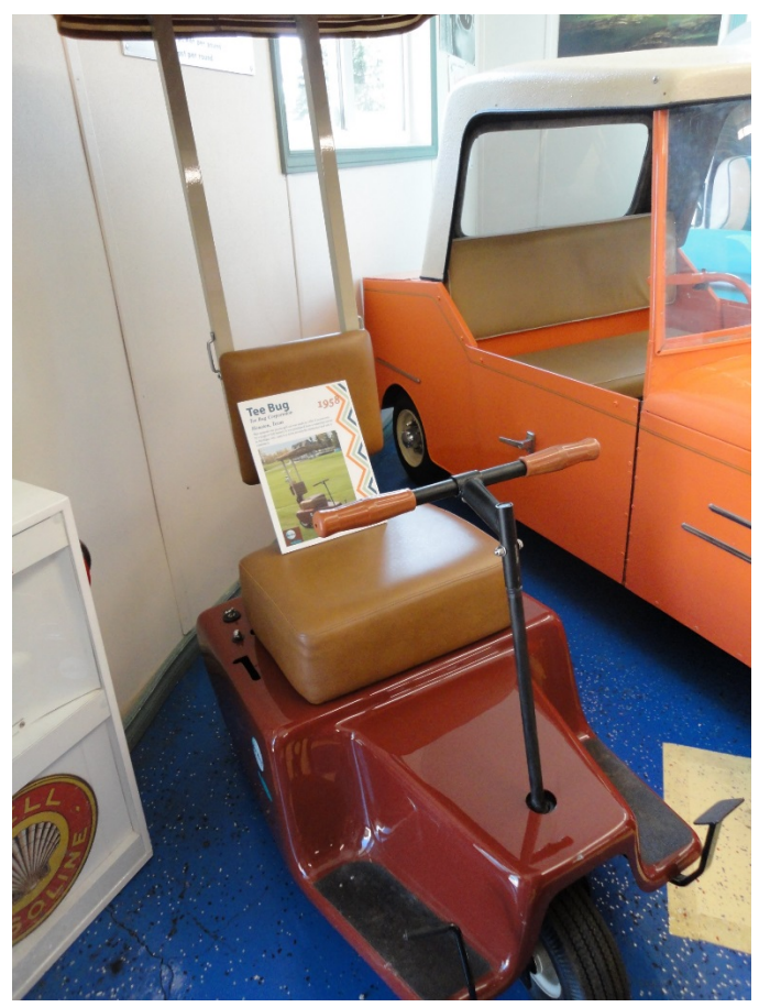
Tee Bug, Tee Bug Corporation, Houston, Texas. This unusual one-person golf car was made in 1958. It is powered by a single 6-volt battery. It was purchased from a restaurant owner in Michigan who used it to drive around the restaurant and talk to customers.

The bright orange car in the right of the photo is The Sports Rider by the Electric Car Company of California – Long Beach. The Sports Rider is another prime example of an electric micro-car which had an optional golf bag attachment. This is an example of a little car that had a dual purpose. It was designed both to quietly travel around small towns and also make its way onto the golf course. Many of these cars could be spotted on both Catalina and Annabelle Islands off the coast of California.