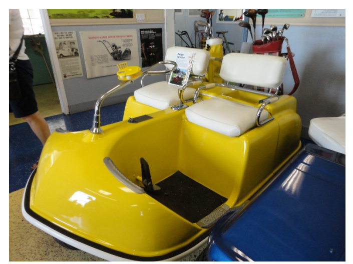
Badger Canadian, Mechanical Pin Resetter Co. Inc., Calgary, Alberta 1960

The popular Caddy Car turf models debuted in 1960 and included the Ace, the Birdie and the Eagle. The Eagle and Ace were made in Michigan with the Birdie made in Texas. All were powered by Kohler engines with the Eagle having an electric motor option. Logos included PPC (Powered Products Company) and PPT (Powered Products of Texas).